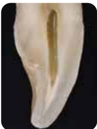
Prof. Marleen Peumans (Belgium)

Traditional shade systems rely on different hues (colours), known as A, B, C and D. However, it is known that enamel and dentin have different characteristics , both contributing to the final shade perception of teeth. By breaking away from traditional monochromatic shades and focusing on reproducing the characteristics of enamel and dentin , you can obtain a much more natural result in just two simple layers.